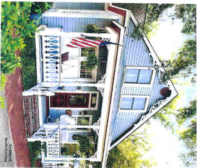
Southport, North Carolina

One stroll through town (and perhaps a stop at Bull Frog Corner, with its barrels of peppy candy) makes it easy to see why Southport has long been sought after as a film location. Bright white cottages with red roofs, stately sea captains' homes, two